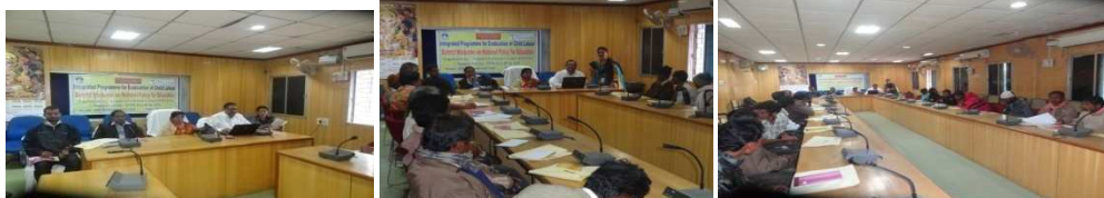
State level advocacy workshop on June 12 th World day against child labour