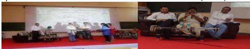
ECOSAVERS Youth Network Members in action on world water day waste water management 25 th March & in Raahgiri on March 20 th to save water campaign